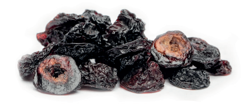
Dried Sour Cherry