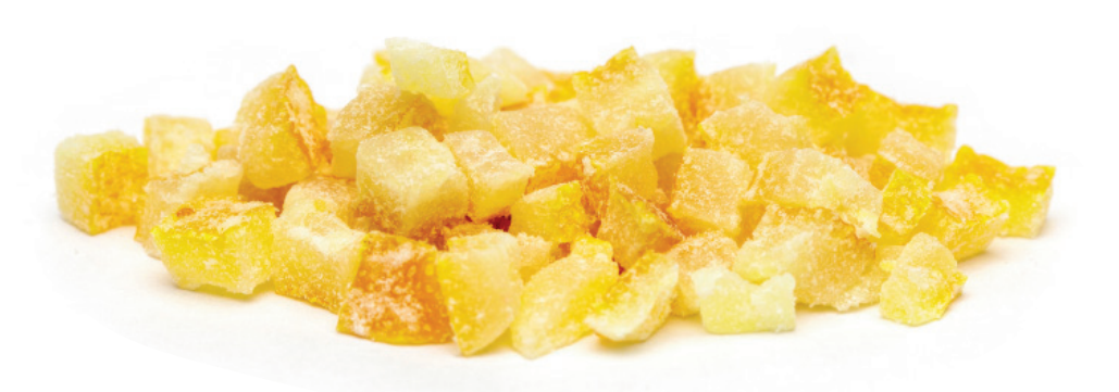
Candied Orange Peel