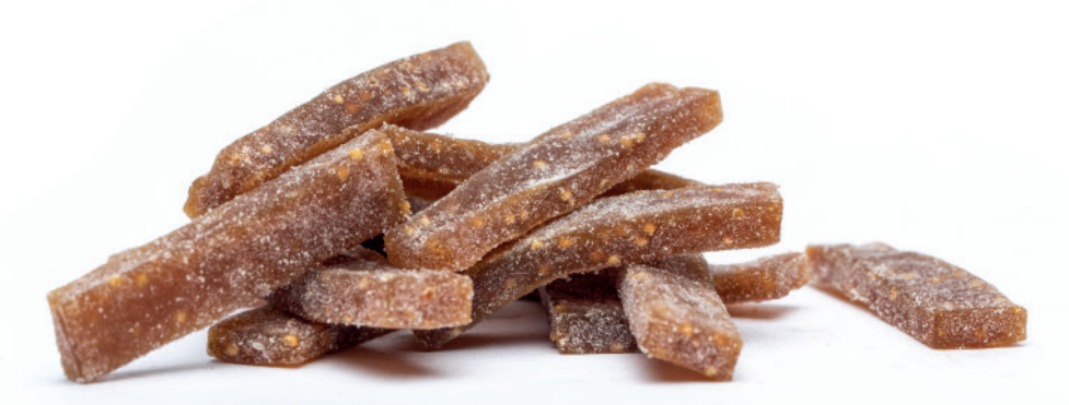
Fig Cubes and Strips